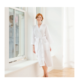
TC086 - Page 23 Waffle Robe