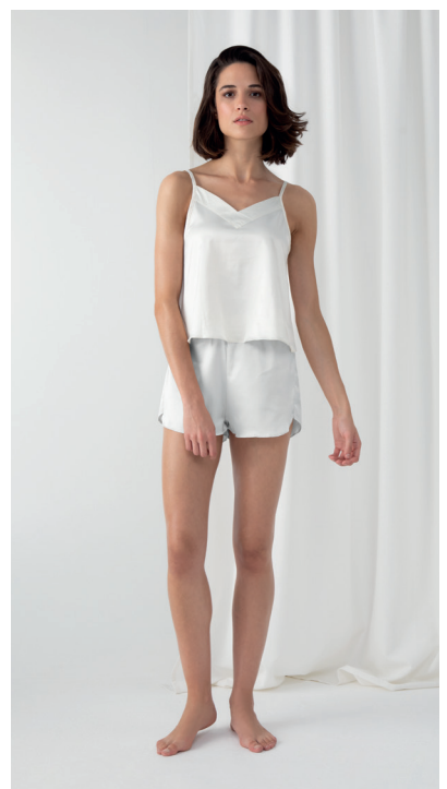
TC057 - Page 16 Ladies' Satin Cami Short Pyjamas