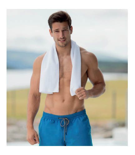
TC017 Microfibre Sports Towel 30 cm x 110 cm

Lightweight and highly absorbent sports towel with overlocked edge.