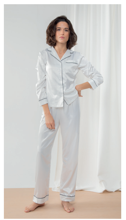
TC055 - Page 15 Ladies' Satin Long Pyjamas