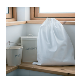
TC063 - Page 25 44x53cm Laundry Bag