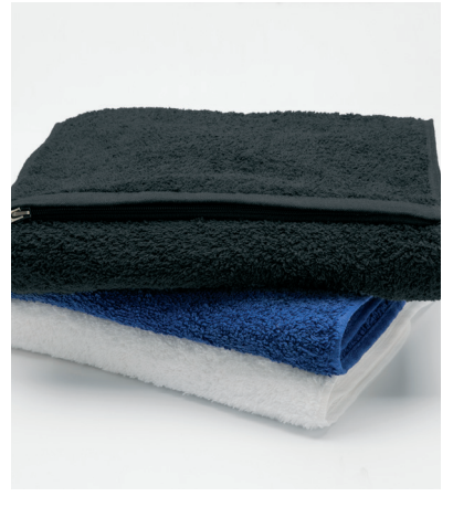
TC007 Luxury Pocket Gym Towel 30 cm x 100 cm

Pocket gym towel with zip access pocket. Pocket height is 17cm.