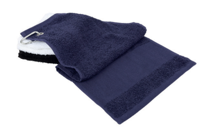
TC033 - Page 6 Printable Border Golf Towel