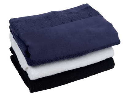
TC035 - Page 7 Printable Border Bath Towel