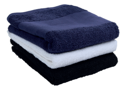
TC034 - Page 6 Printable Border Hand Towel