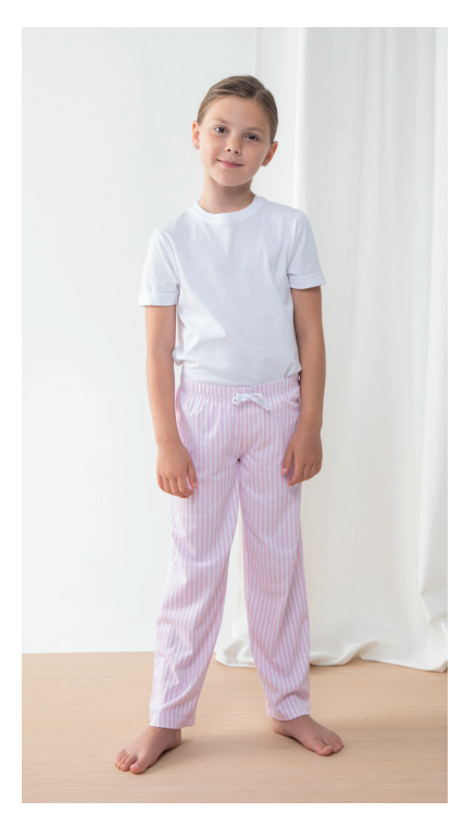
TC059 - Page 18 Children's Long Pyjamas