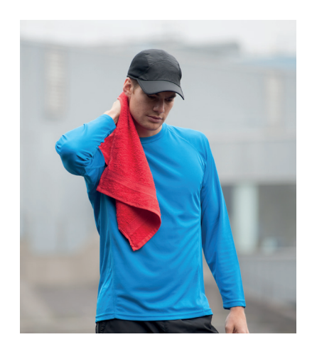
TC002 Luxury Gym Towel 40 cm x 60 cm

Luxury fabric with soft, deep pile, herringbone border and hanging loop.