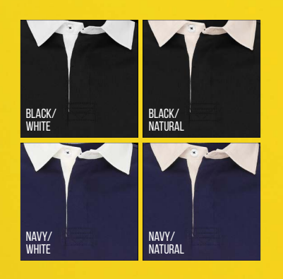
Sizes: S 37" M 40" L 42" XL 44" 2XL 47" 3XL 49" Fabric: 100% Cotton. Weight: 260gsm Decoration on garment(s) for illustrative purposes only – supplied blank.

Available in four classic shades, here is the perfect transitional piece from season to season. This longsleeved polo will keep you warm during the colder seasons, whilst the lightweight fit makes it wearable all year round.